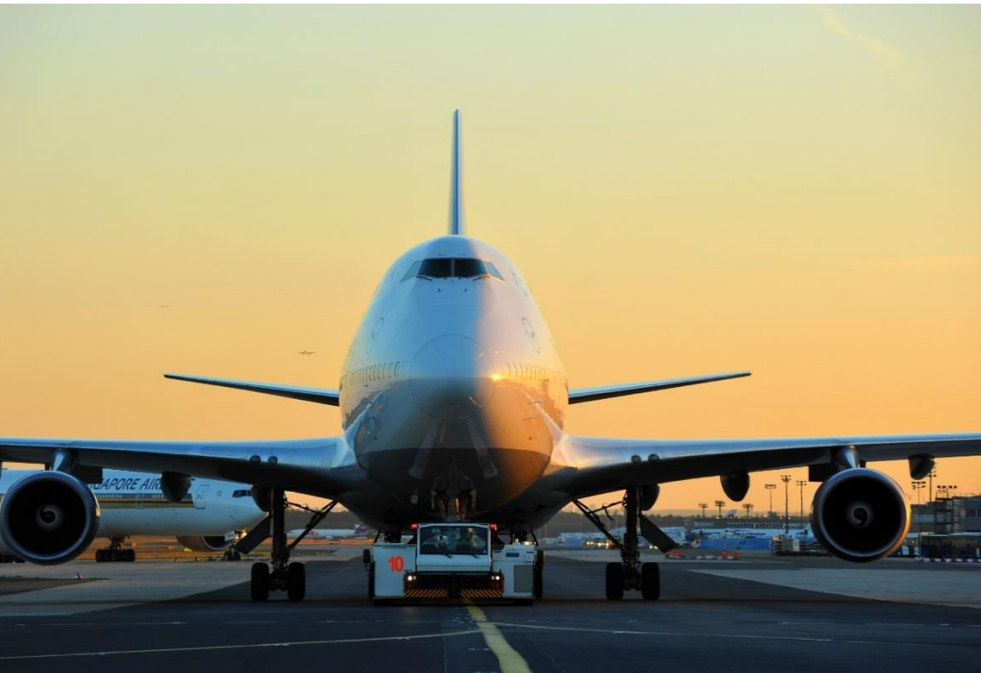
We provide all kind of airfreight services