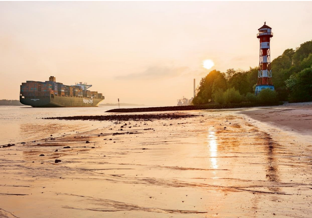
Worldwide seafreight shipments: FCL, LCL, Breakbulk, RoRo, Conventional shipments