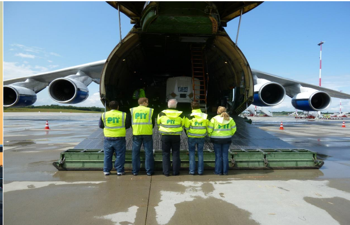
If needed, we perform part or full charter