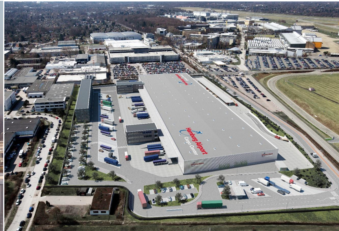
We can rely on over 1500m 2 storage area