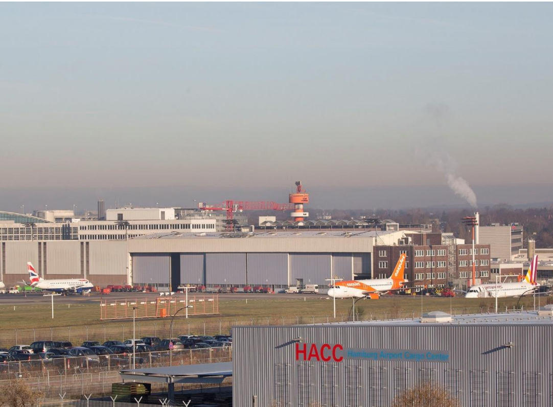
Our location at the Hamburg Airport